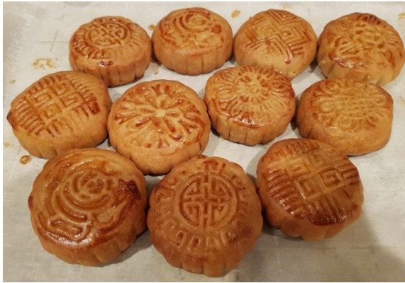
Baking Mooncakes by Serena Tang. This project relates mythology and religion to the Moon. Mooncakes are prepared and eaten during the Mid-Autumn Festival, the timing for which is partly based on a full Moon.